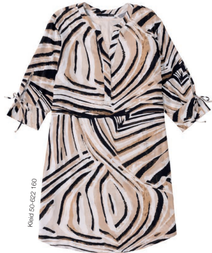
Kleid 50-622 160