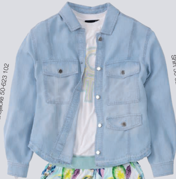
Shirt 50-623 304