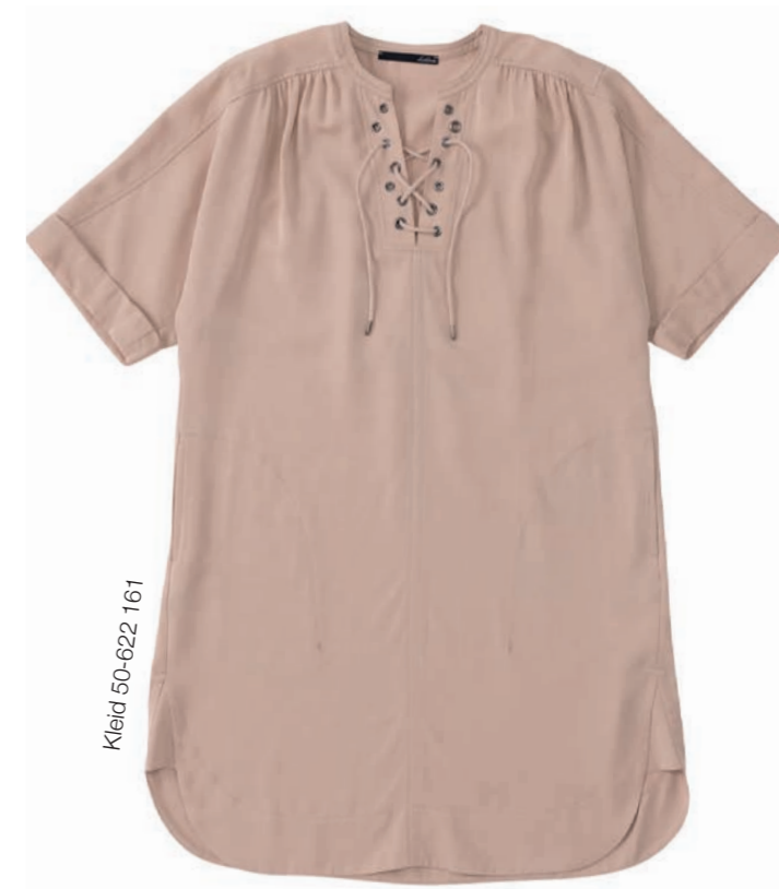
Kleid 50-622 161